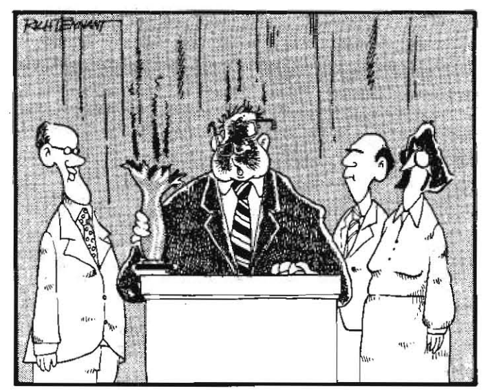
"I'D LIKE TO THANK EVERYONE FOR RECOGNIZING MY COMPANY AS THE LEADER IN COPY-PROTECTED SOFTWARE."

Virus news. The author of CyberAIDS has issued an update to his program called Festering Hate . Files infected with this virus have been uploaded to a number of bulletin boards, but the speed at which they are discovered is remarkable. We have far more reports of virus spot-